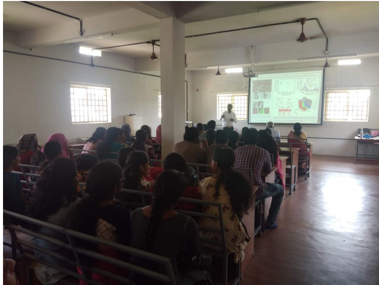
Figure 1: Live class with streaming

EdSpace Creative Lab (ECL) is a venture of Digital Solutions Committee of the college in the wake of e-resources and technologies to augment teaching-learning. The ECL has recording facility and lecture capturing system. There are equipments such as LCD high resolution ceiling mount projector, terabyte storage devices for storing virtual class sessions, high end noise suppressing microphone, software for live classroom sharing provided by CISCO webex, and open source virtual board application etc.